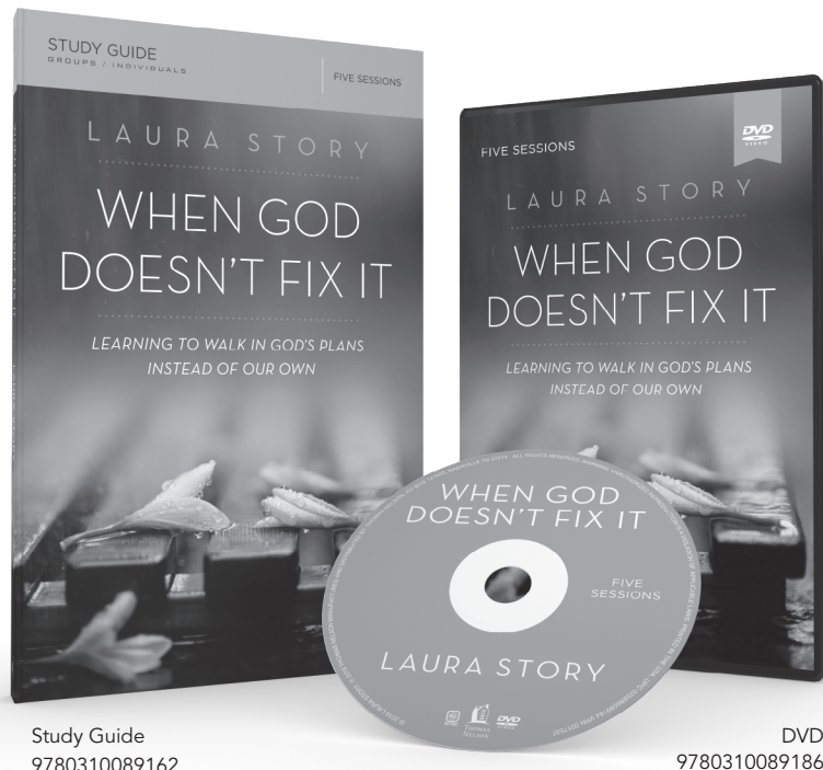
Study Guide 9780310089162

God may not fix everything in our lives. In fact, our situation might not ever change or get better. But we can know that God will lead us to a place where we are better because of it.